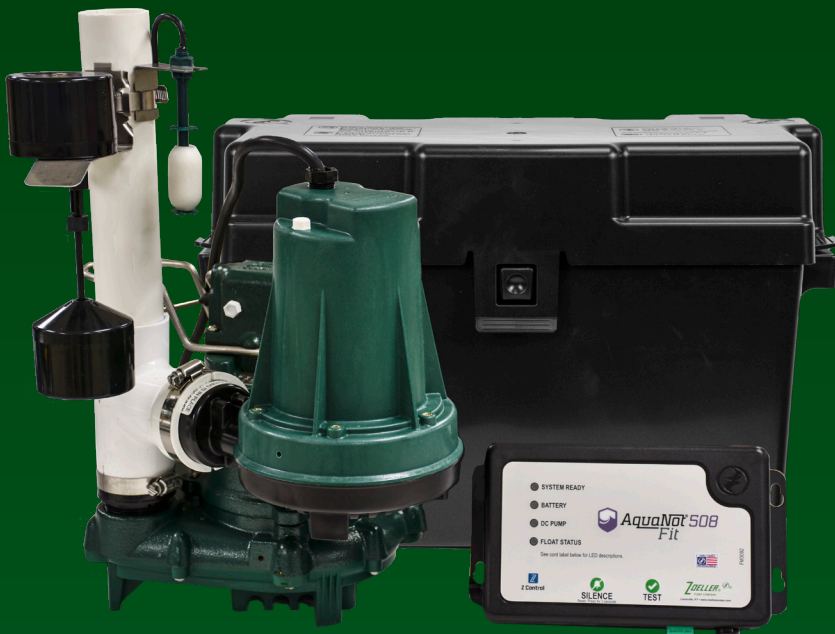
ProPak 508-0015 shown

Self-testing, Z Control® enabled system provides convenience & confidence in your flood protection