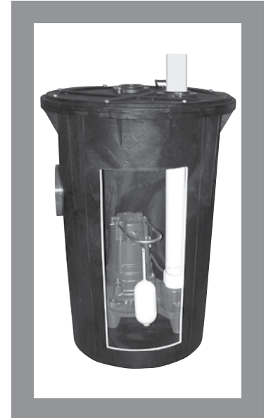
Products may not be exactly as pictured.

OPTIONS: Zoeller recommends a High Water Alarm for added protection. See FM0732 for available models