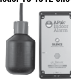
Model 10-4012 shown.

OPTIONS: Zoeller recommends a High Water Alarm for added protection. See FM0732 for available models