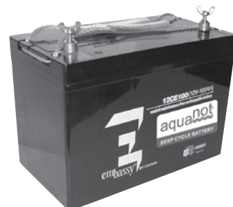
Aquanot® Deep-cycle Battery (purchase separately) P/N 10-1450 - AGM (shown) P/N 10-0761 - Wet