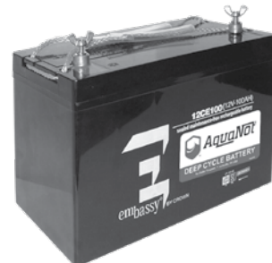
Aquanot® Deep-cycle Battery (purchase separately) P/N 10-1450 - AGM (shown) P/N 10-0761 - Wet