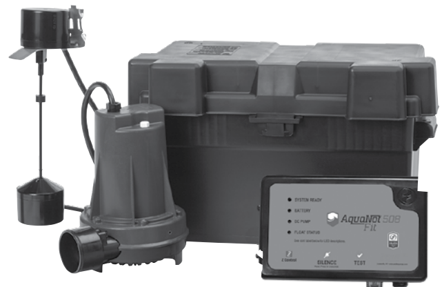
Aquanot® Fit 508 system