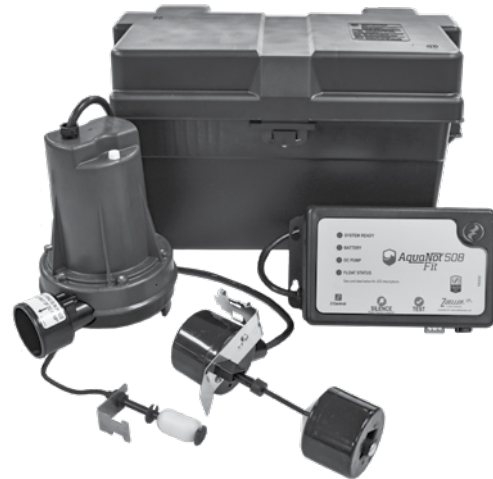
Aquanot® Fit 508 system