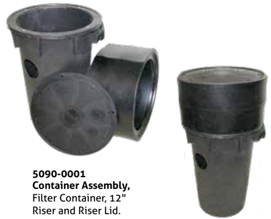
5090-0001 Container Assembly, Filter Container, 12" Riser and Riser Lid.

The Container Assembly is designed to intercept the existing effluent discharge line outside the septic tank while accommodating a Zoeller Pump Company WW1 residential effluent filter (p/n 170-0078 or 170-0144) inside the basin. The system is also useful in capturing laundry lint in homes where washing machine water is directed to a separate designated drainfield. The Container Assembly comes complete with the basin, 12" tall riser, riser lid, lid screws, SDR 35 and SCH 40 pipe seals, and a foam gasket. Additional 6" and 12" riser extensions are available.